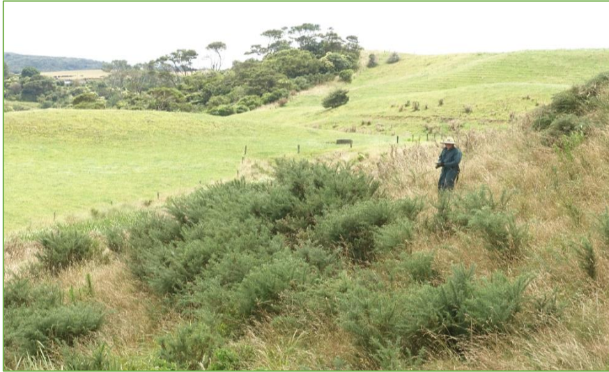
Preparing fenced off site via gorse removal

Both Wallis and Hall farms have committed to retiring more wetlands and riparian areas for us to plant this year.