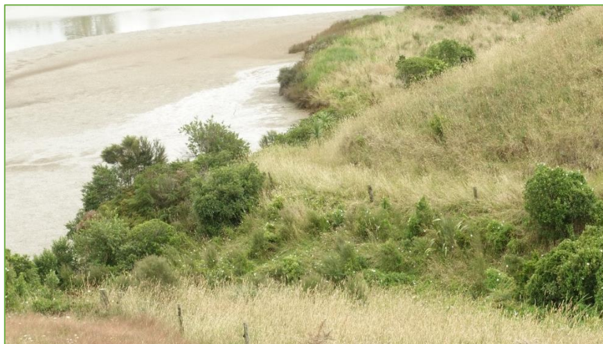
Planting from 2 years ago